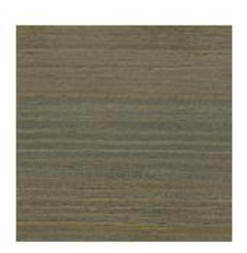
Starlit Gray Transparent